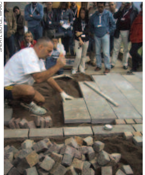
Lesson at porphyry quarry