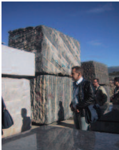
Architects at block yard