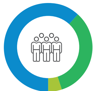
Delegates from the host province Delegates from other provinces International delegates