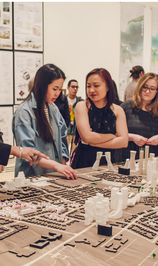
Ottawa: You're so Vanier, 4th year B.Arch Studio project (2015-2016)