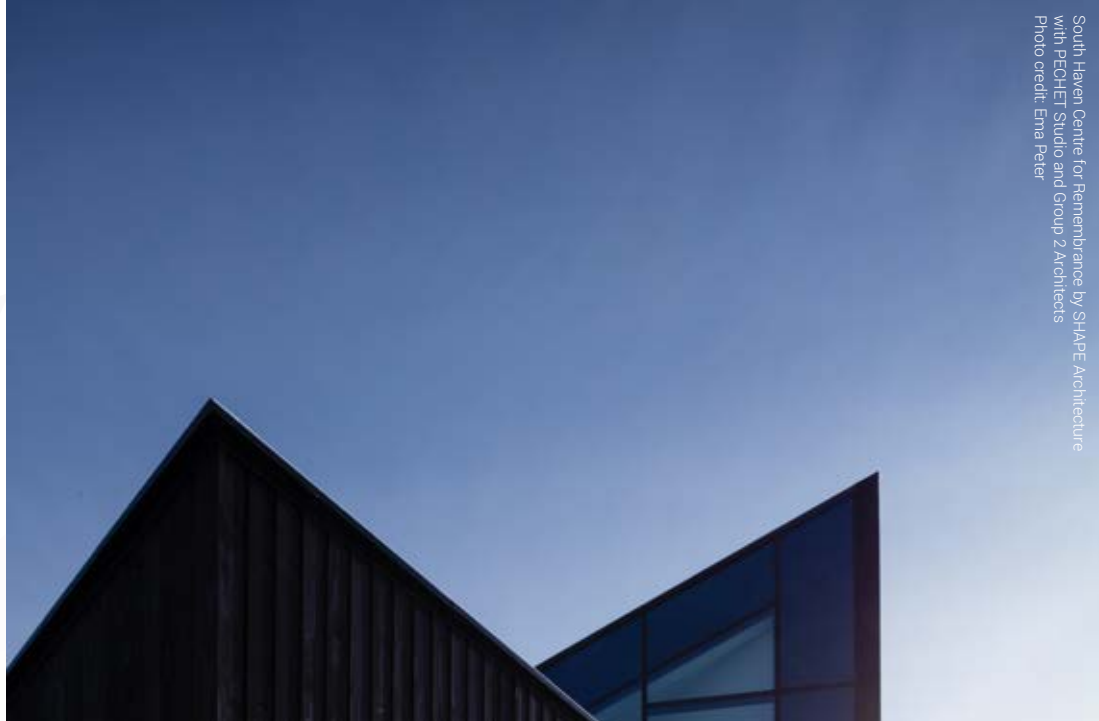
South Haven Centre for Remembrance by SHAPE Architecture with PECHET Studio and Group 2 Architects